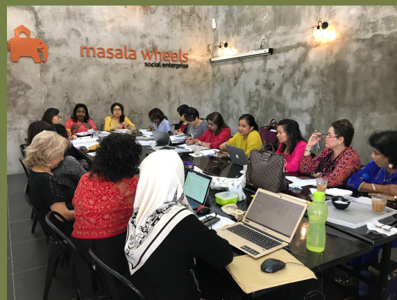
The Executive committee meeting held on 15.3.10 at Masala Wheels, a social enterprise