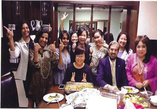
5 May 2014: Theme: Nostalgia

For more details on Toastmasters International, the parent organization, please log into www.toastmasters.org