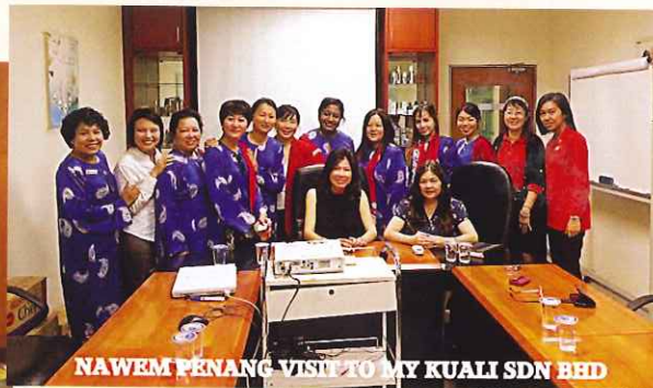
NAWEM PENANG VISIT TO MY KUALI SDN BHD