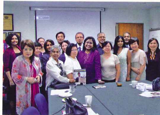
The Demo Meeting: December 2013