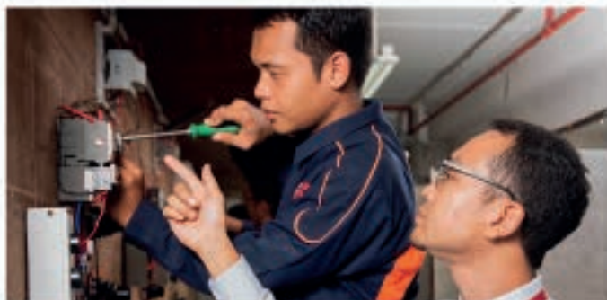
CERTIFICATION IN THREE PHASE ELECTRICAL INSTALLATION AND MAINTENANCE (WIRING)