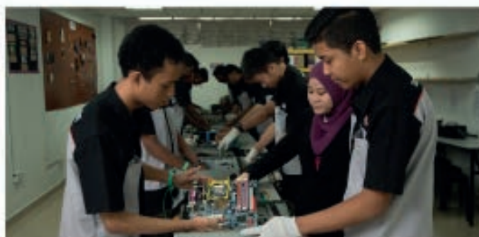
DIPLOMA IN COMPUTER SYSTEMS

DIPLOMA KEMAHIRAN MALAYSIA (DKM) PROGRAMS WE OFFER: