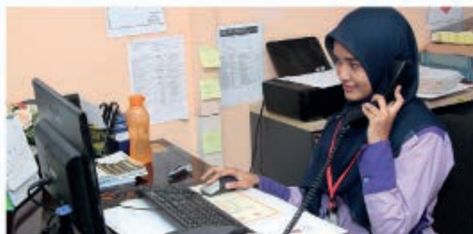
DIPLOMA IN INFORMATION SYSTEMS ADMINISTRATION