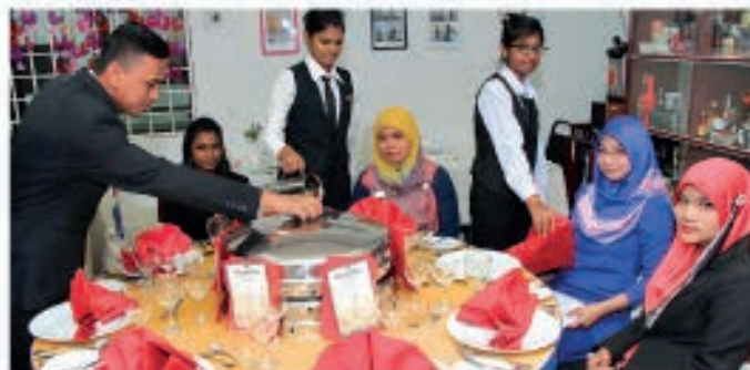
DIPLOMA IN FOOD AND BEVERAGE MANAGEMENT

PROVIDING SKILLED WORK FORCE & SKILLFULLY TRAINED INTERNS